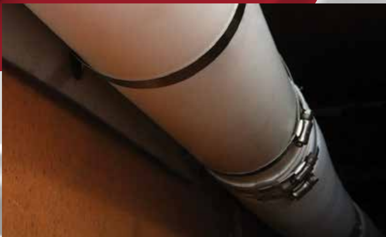
Installation Into A Masonry Chimney With An Offset (not shown)